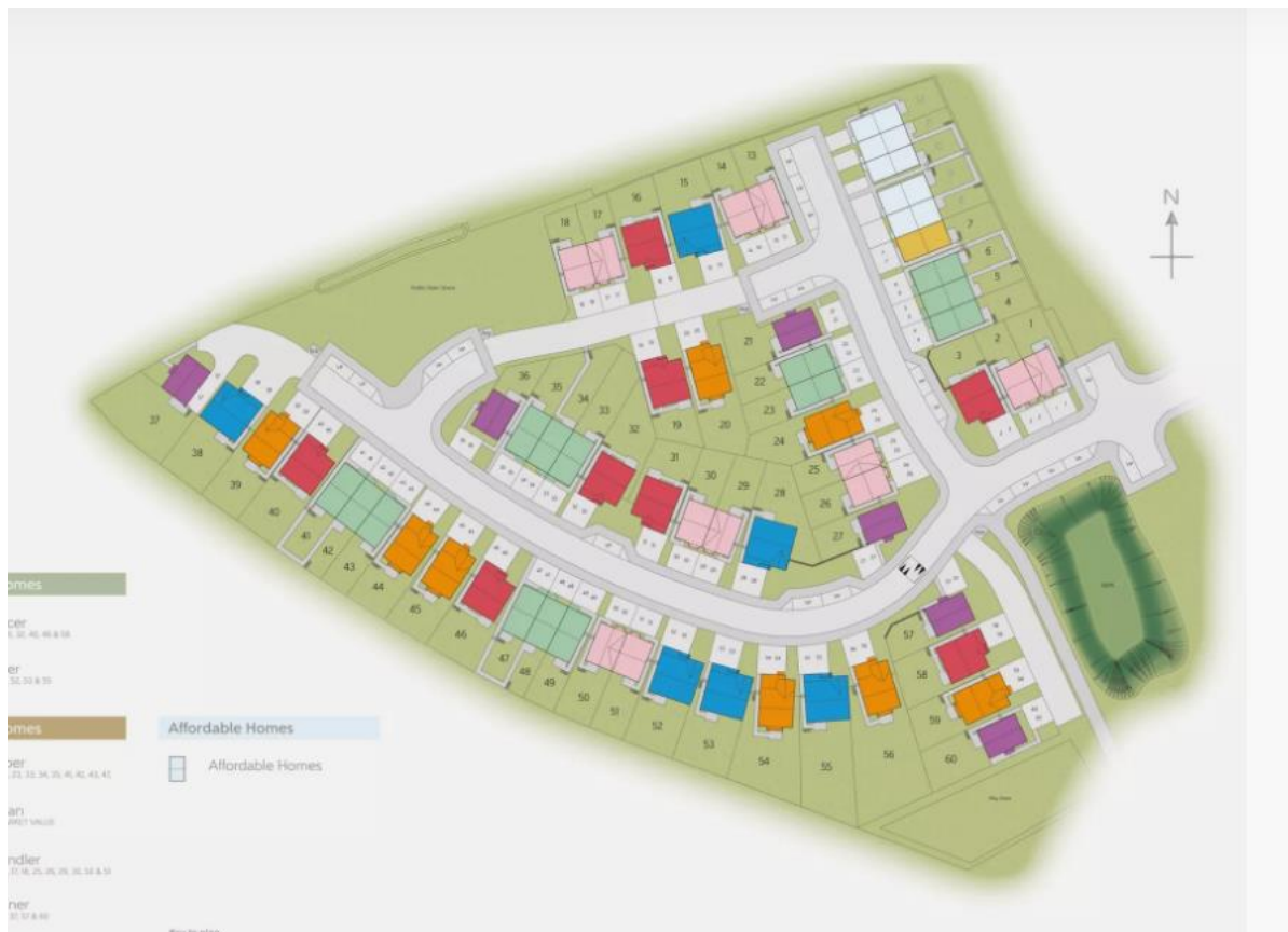
PLAN FROM HOUSE BUILDER approx. 60 units.